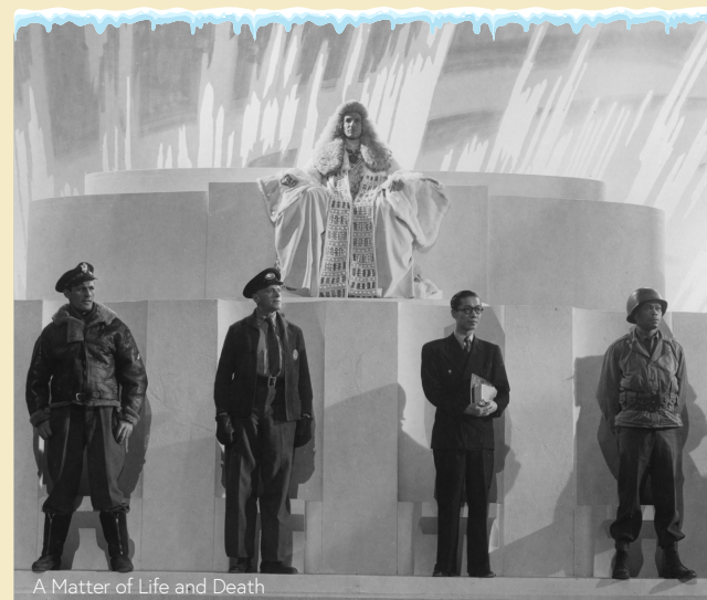
A Matter of Life and Death